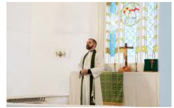
Houses of Worship